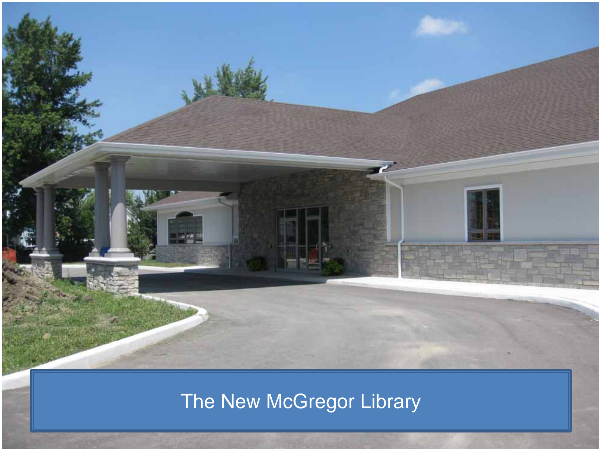
The New McGregor Library