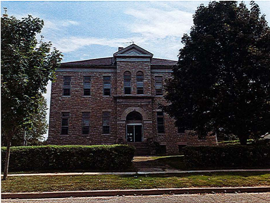
West (Main) façade of 247 Brock Street (August 9, 2021)