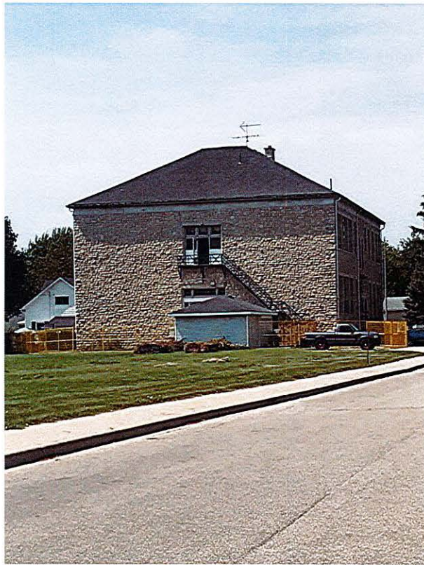
East facades of 247 Brock Street (August 9, 2021)