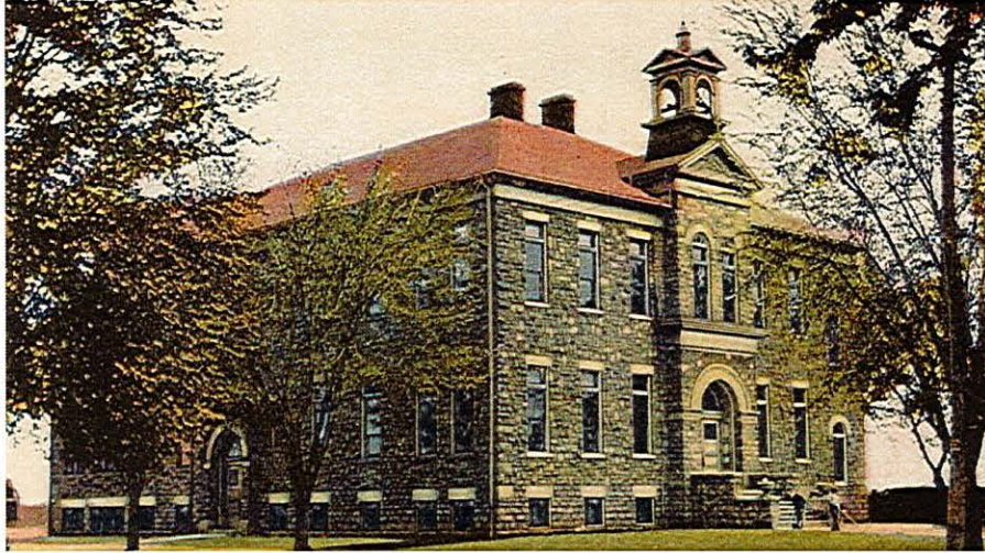
Historic view of West (main) and North Facades, no date