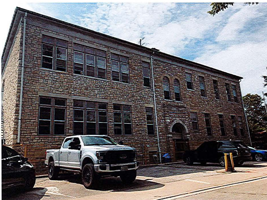
North façade of 247 Brock Street (August 9, 2021)