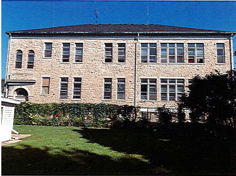
South façade of 247 Brock Street (September 2, 2021)