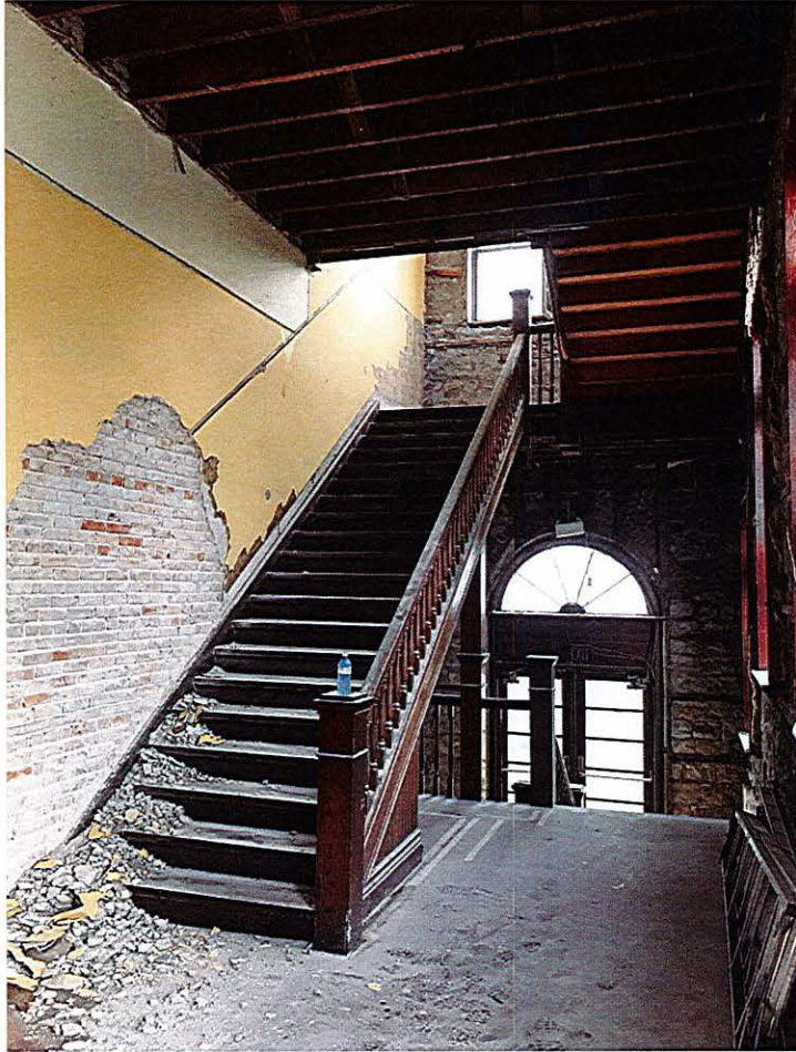
An example of one of the two staircases of 247 Brock Street (August 9, 2021)