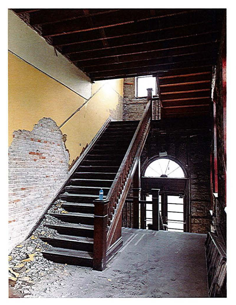
An example of one of the two staircases of 247 Brock Street (August 9, 2021)