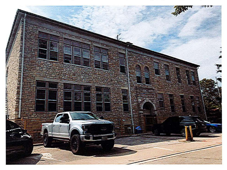
North façade of 247 Brock Street (August 9, 2021)