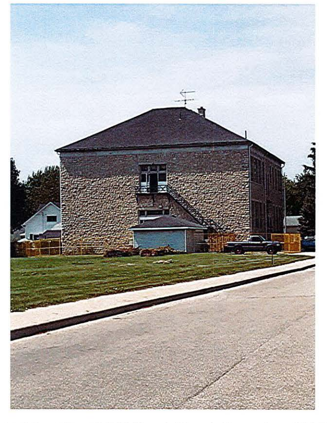
East facades of 247 Brock Street (August 9, 2021)