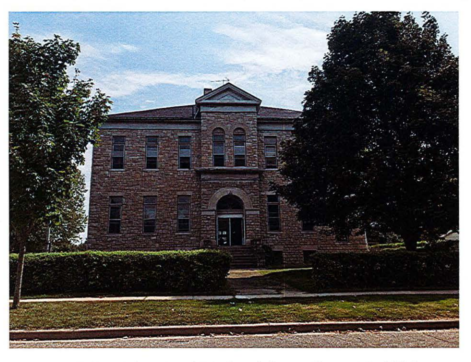
West (Main) façade of 247 Brock Street (August 9, 2021)

Historic view of West (main) and North Facades, no date, Marsh Collection Society PC100.14