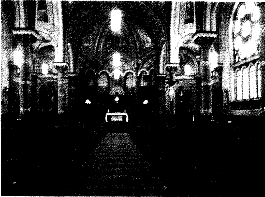
St. Joseph Church - View as you come into the Church