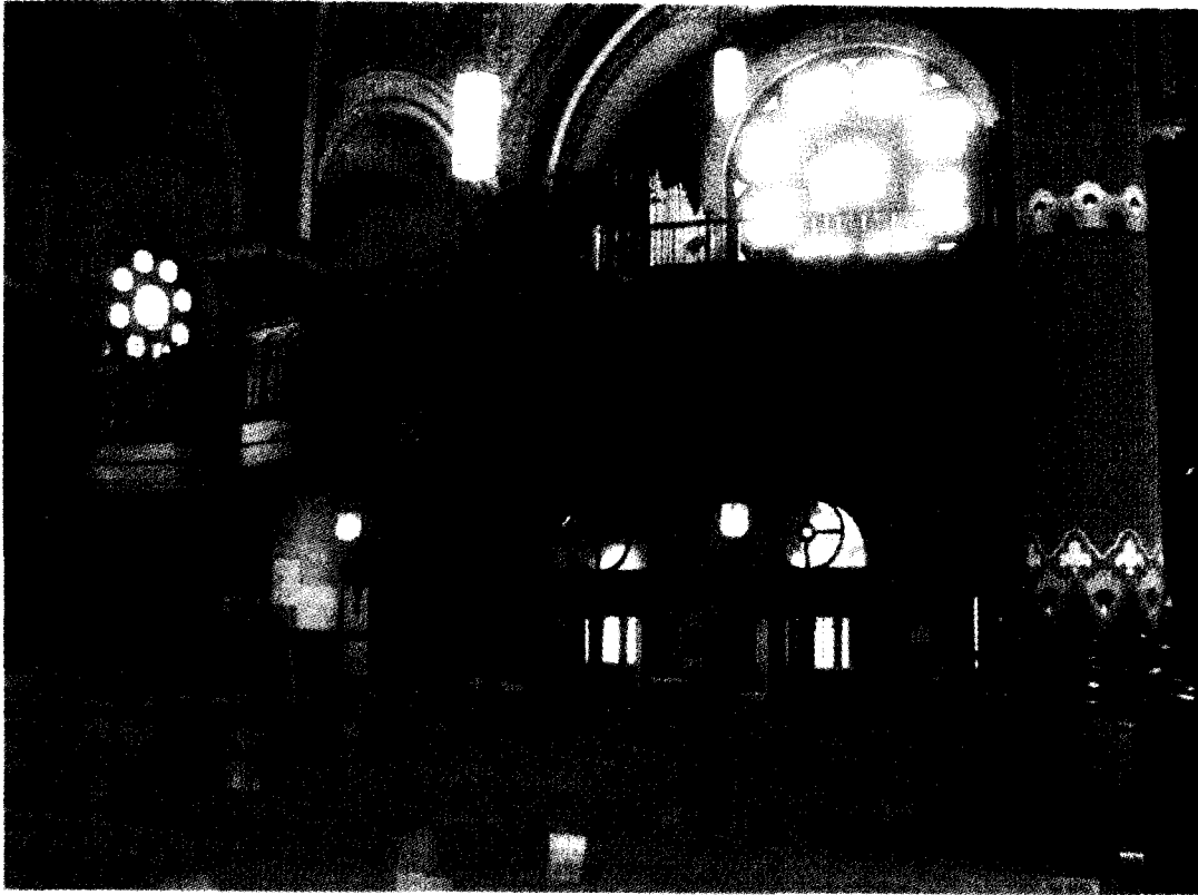
Rear of the Church and the Choir Loft

Over the last ten years an ongoing restoration has been undertaken. The rectory, the Church storm windows and the steps were done first. The massive Church roof was completely redone next while the east, south and north exterior walls have been stabilized with stainless steel rods and repointed. The west wall and the interior still require restoration and will be done as funds allow.