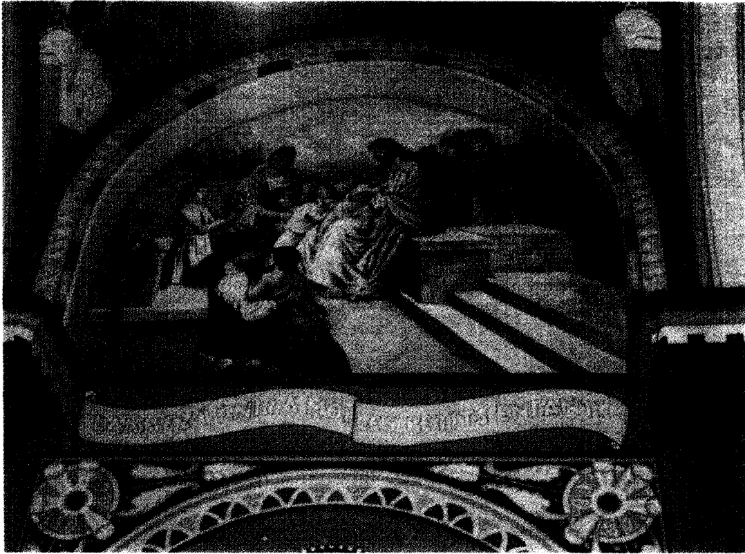
Painting of Jesus and the children over the left altar